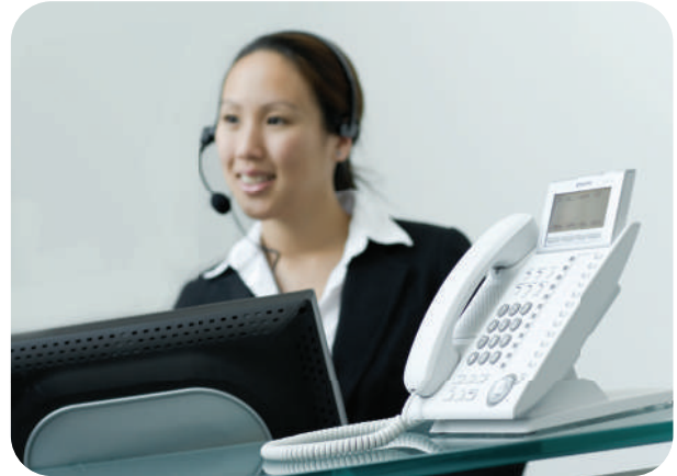
RECEPTIONIST USING COMMUNICATION ASSISTANT

Operator Console also supports the following additional options: