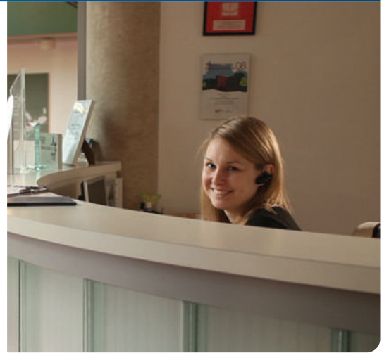
COMMUNICATION ASSISTANT BROCHURE