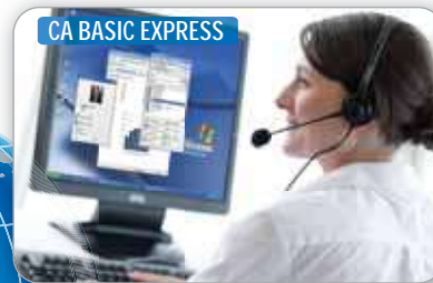
CA BASIC EXPRESS