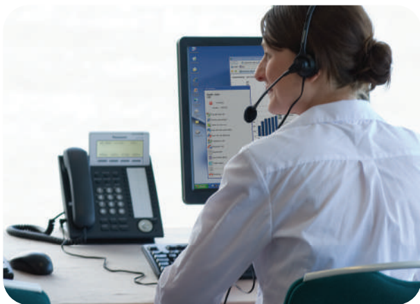
CA - PROVIDING UNIFIED COMMUNICATIONS