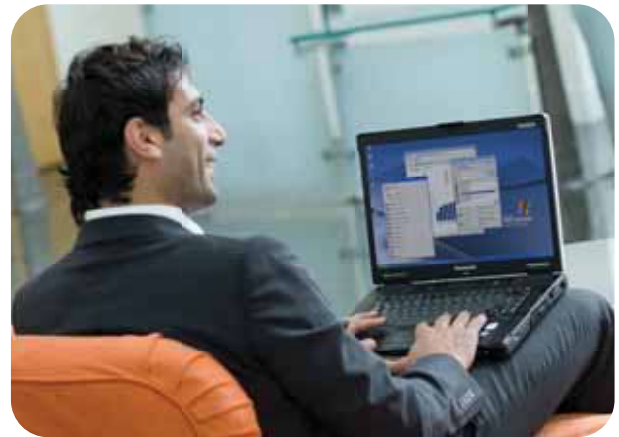
A TEAM MANAGER USING CA SUPERVISOR

Communication Assistant Supervisor application is an indispensable productivity tool for team managers and supervisors. The software allows team leaders an easy way to keep an eye on all their team members' telephony communication activities. Group leaders can easily monitor team member's phone status, call details, presence and availability - perfect for managing an informal call centre or a small team receiving customer calls. In addition to the features supported by CA Pro, the following key features are additionally supported: