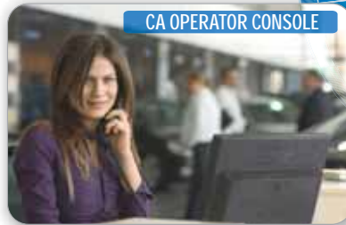
CA OPERATOR CONSOLE